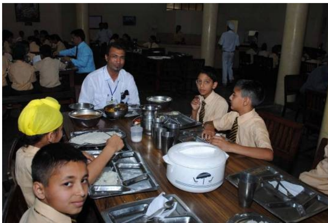
Lunching with students in Junior School Dining Hall.