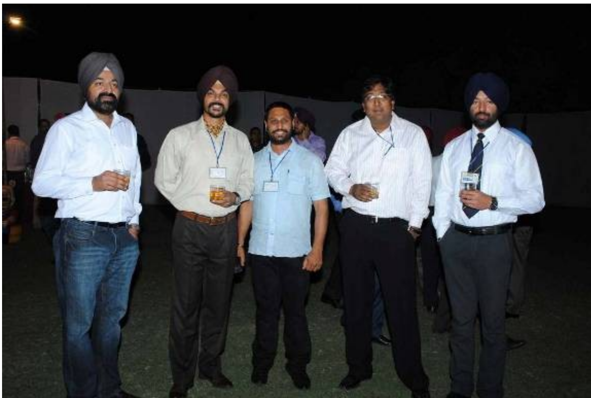
One for memories