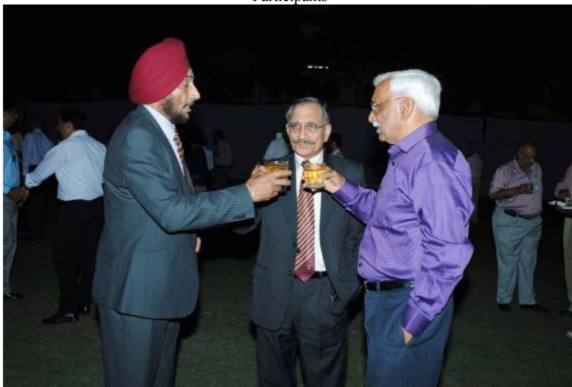
The 'General' idea of the evening !