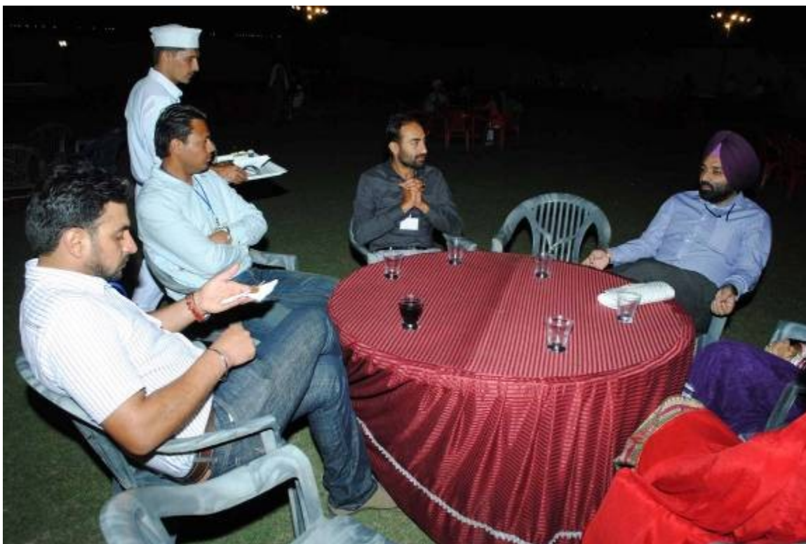
Round Table Conference.. No 1