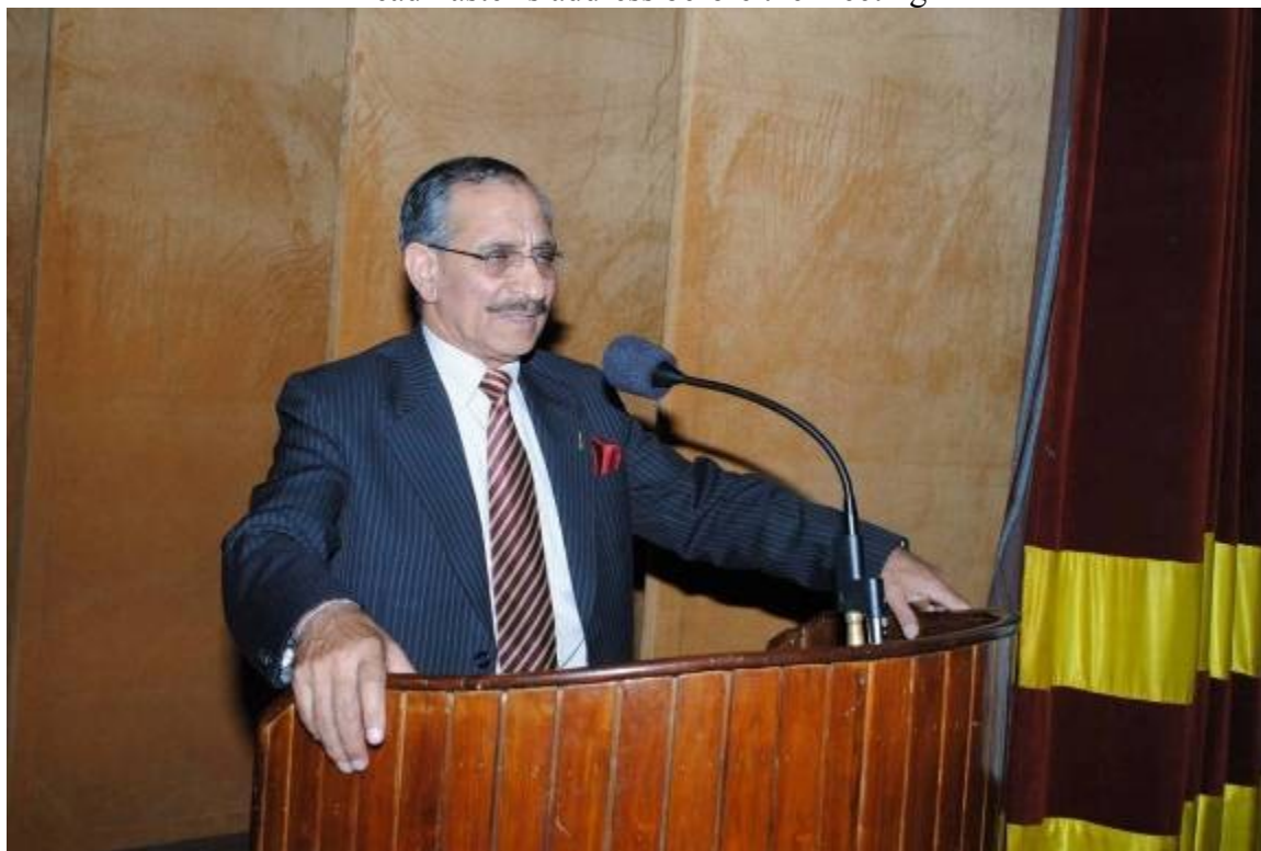
The President addresses the Old Nabhaites