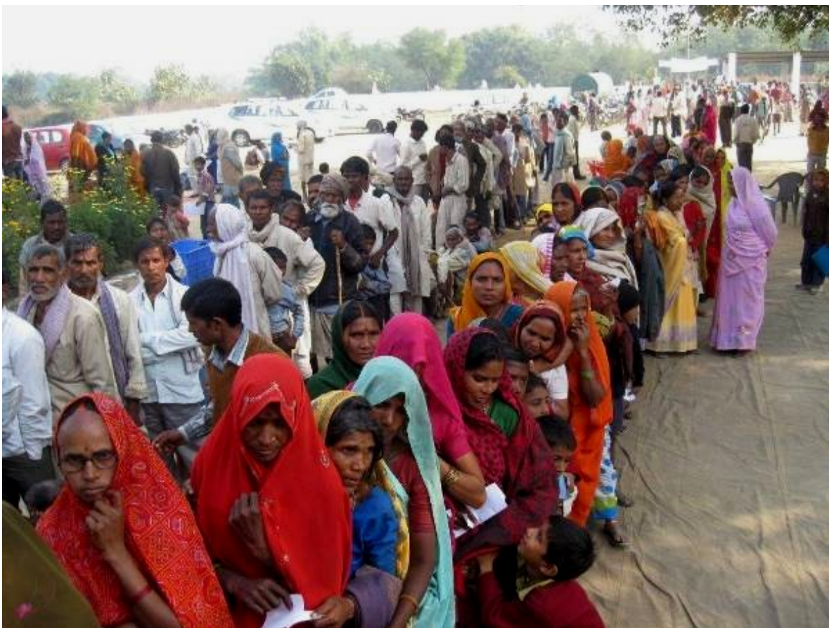
Three lines of patients waiting to be seen by doctors.

While our recent health camps were just a small beginning, I know we have all returned with a very different view of the world! We cannot solve all the problems of that area, but we will certainly try and make a difference. As you will see in the following attached documents, we have a lot of work to do, however, I am fully committed to seeing this through.