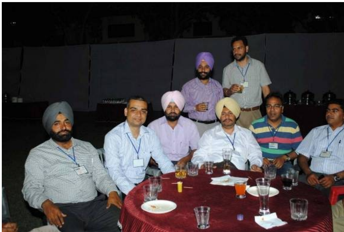
Fellowship in full swing