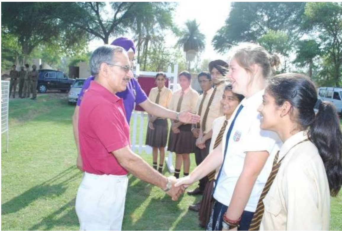
Meeting an exchange student.