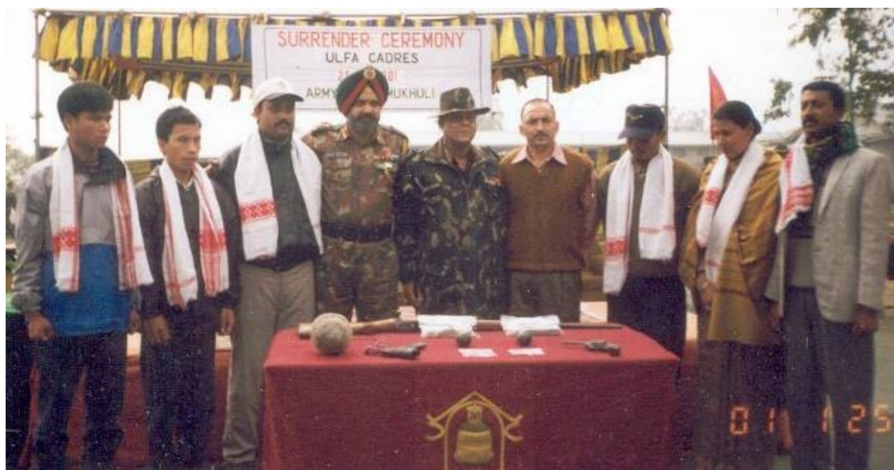
Counter Terrorist Operations In Assam.jpg