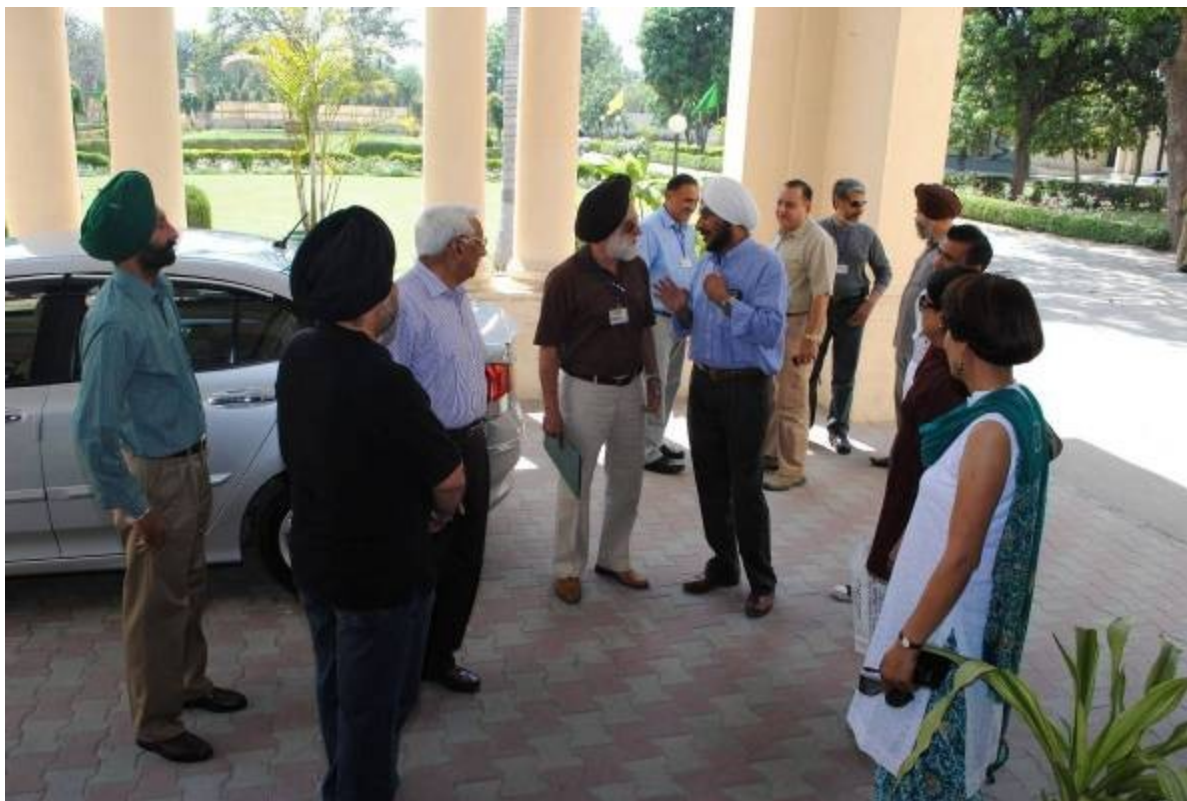
Early arrivals in the Junior School Porch.