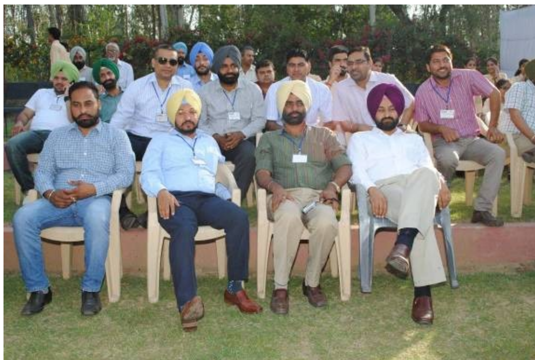
Old Nabhaites cheering both teams.