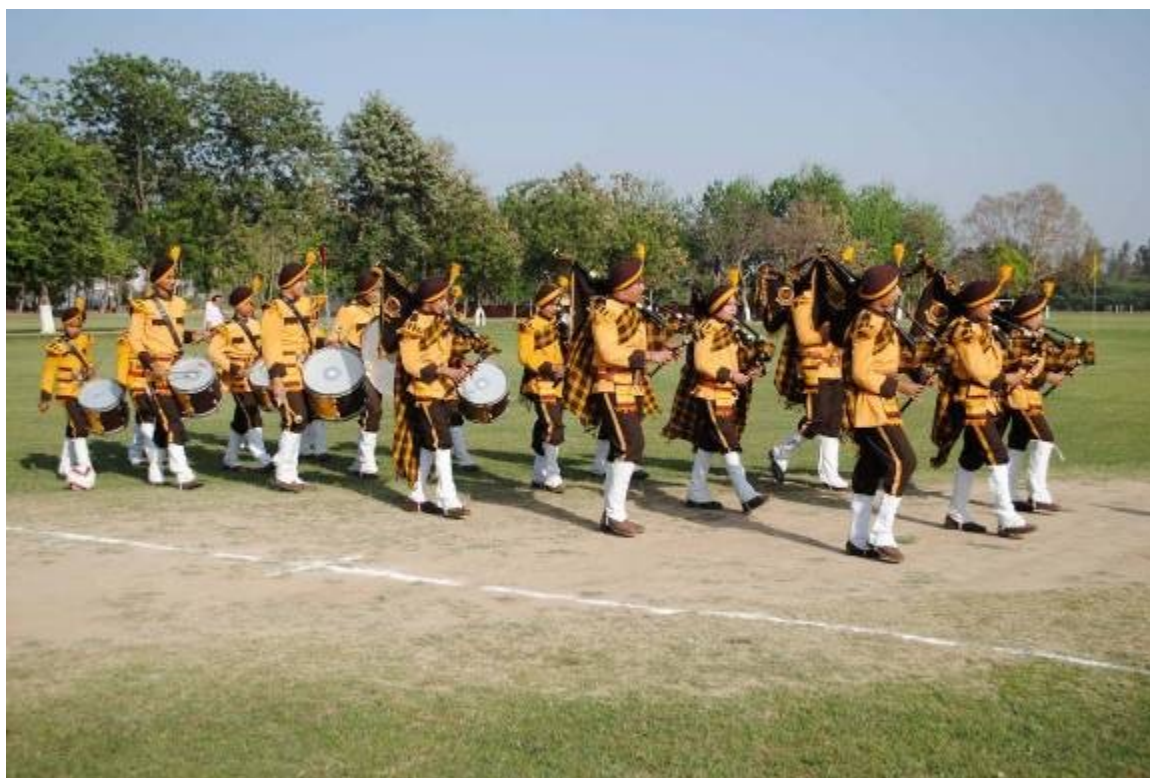
The fabulous Band during break time...