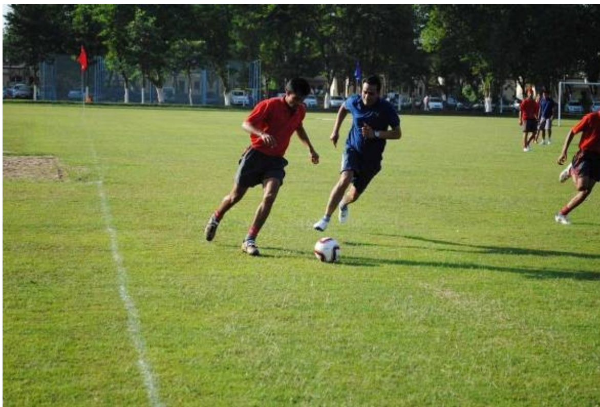
The Past ....