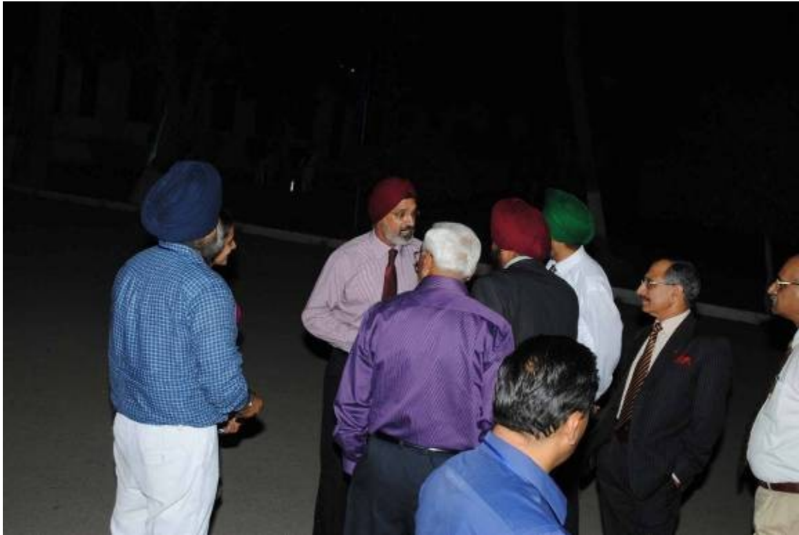
Outside the Auditorium before the meeting