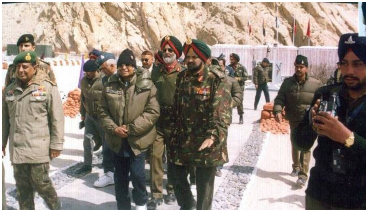
Briefing The Prez In Siachin (1).jpg