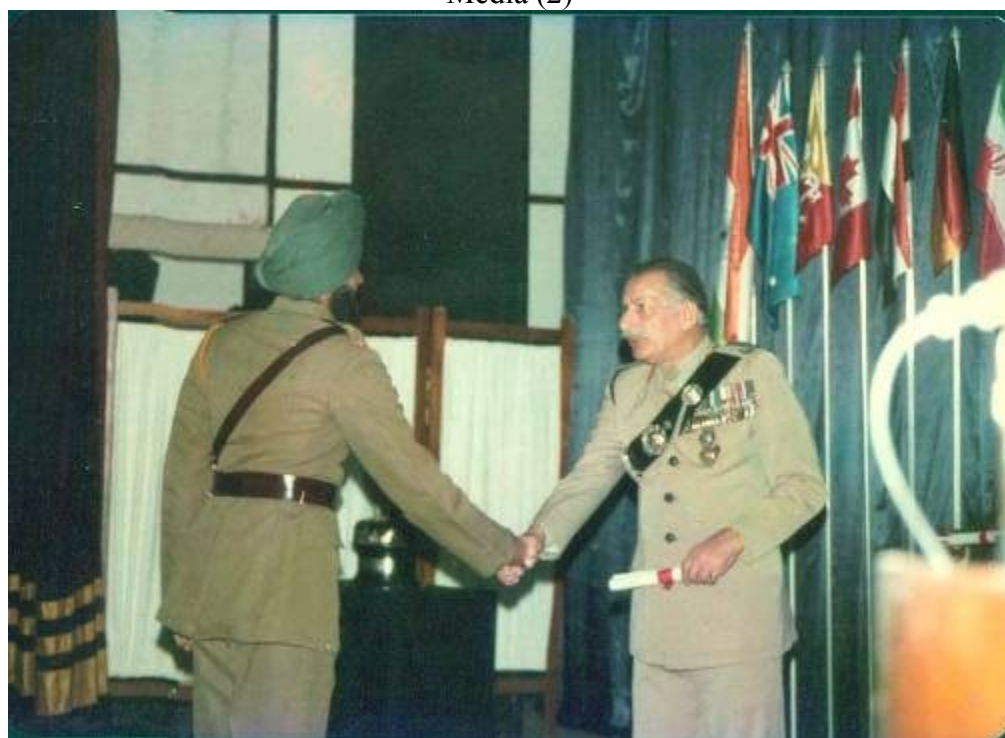
Shabash! From Sam Manekshaw