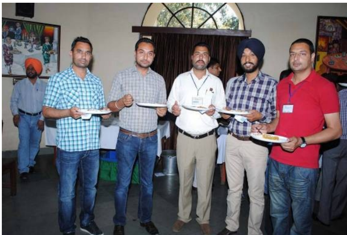
.....made it by Lunchtime.