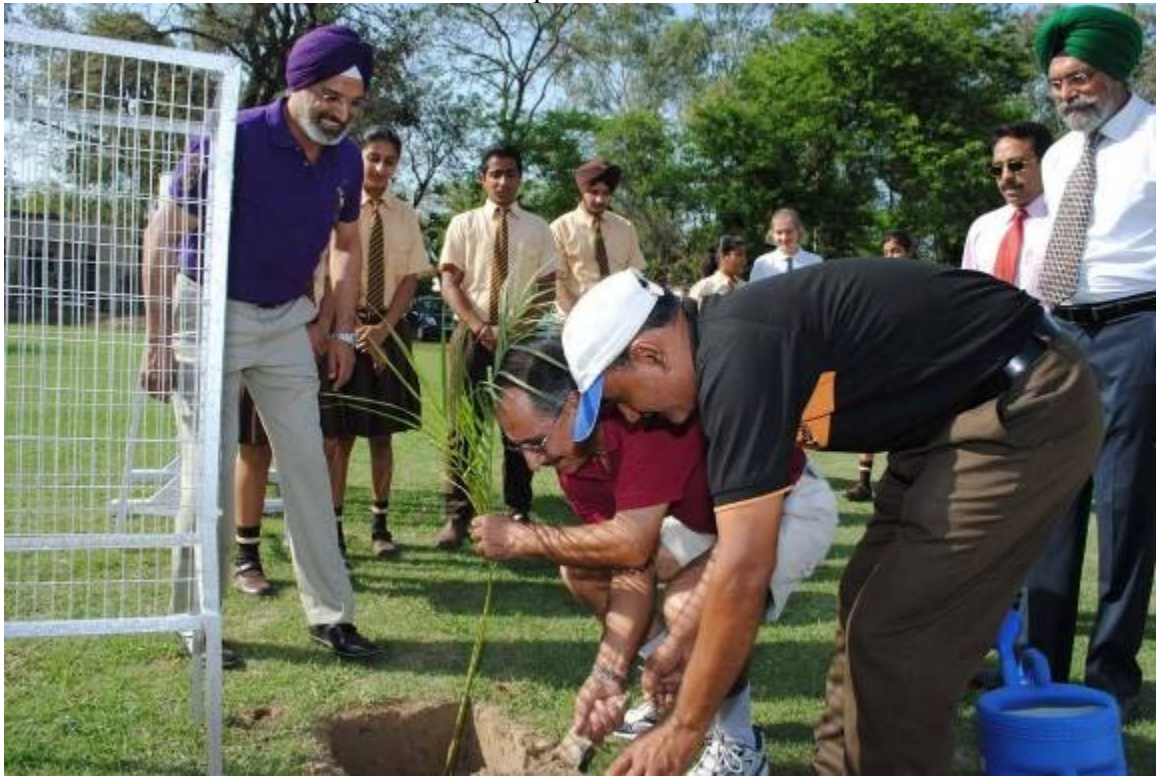
ONA President promotes the green drive.