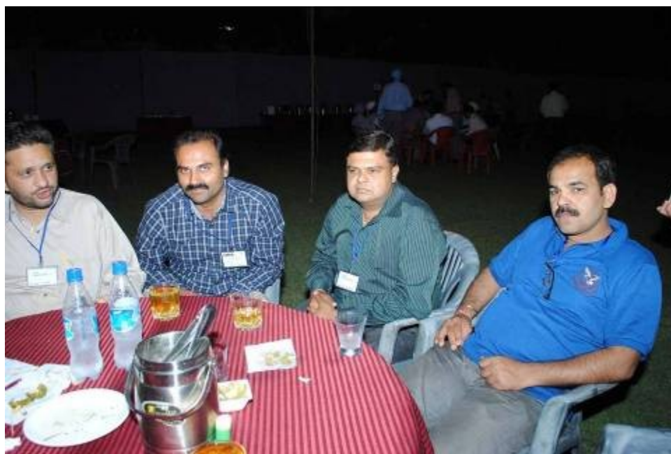
..and No 3..