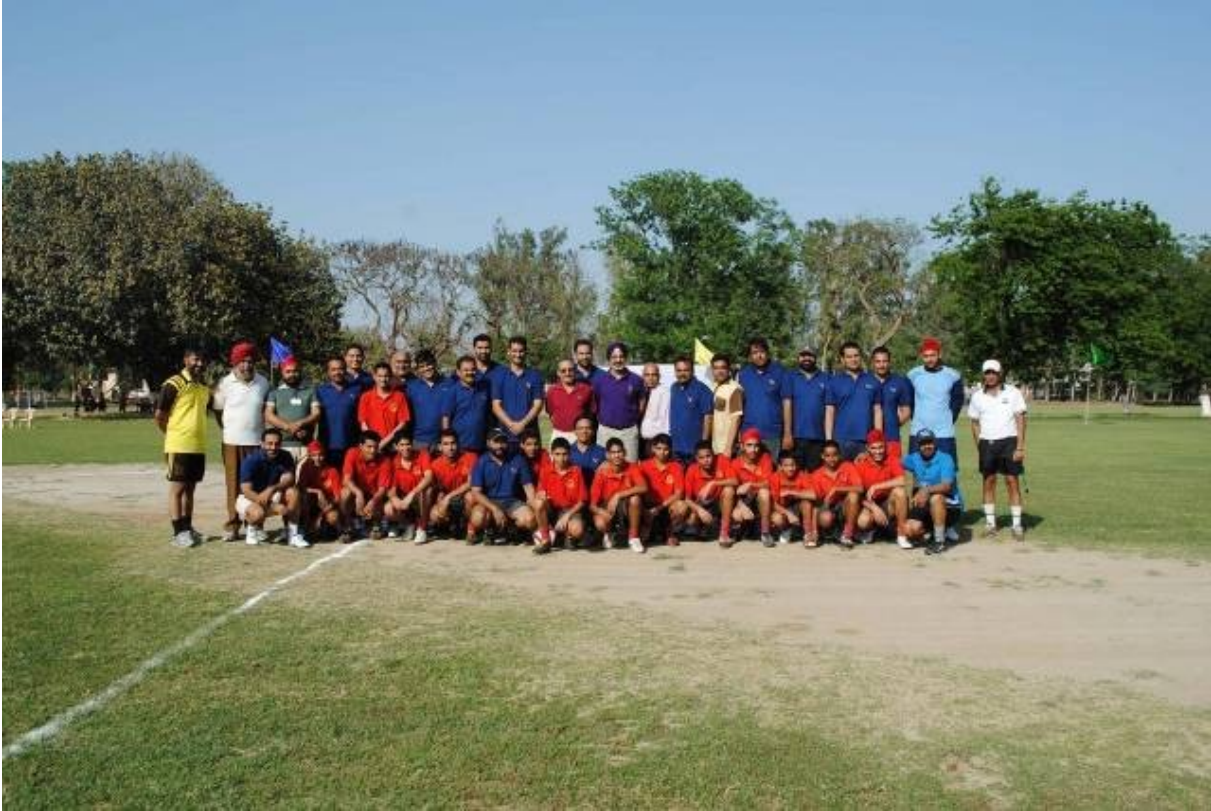
Both teams together at the end. Three cheers for both ... Hip Hip... Hurrah