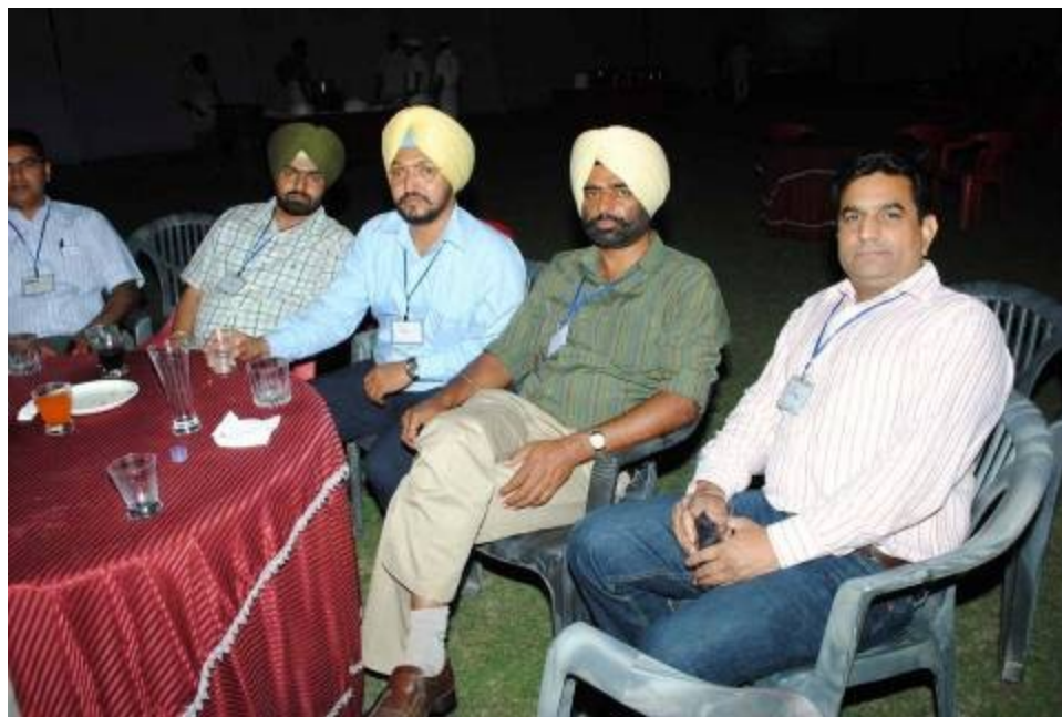
Are you being served?