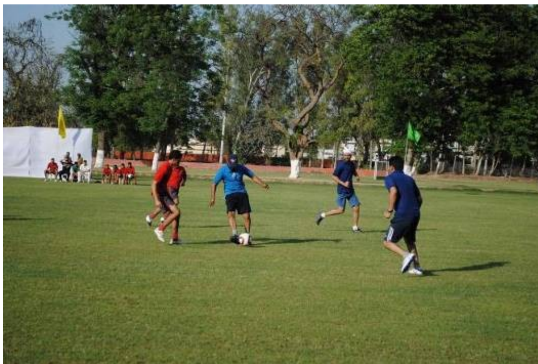
.....and the Present.....chase the ball...