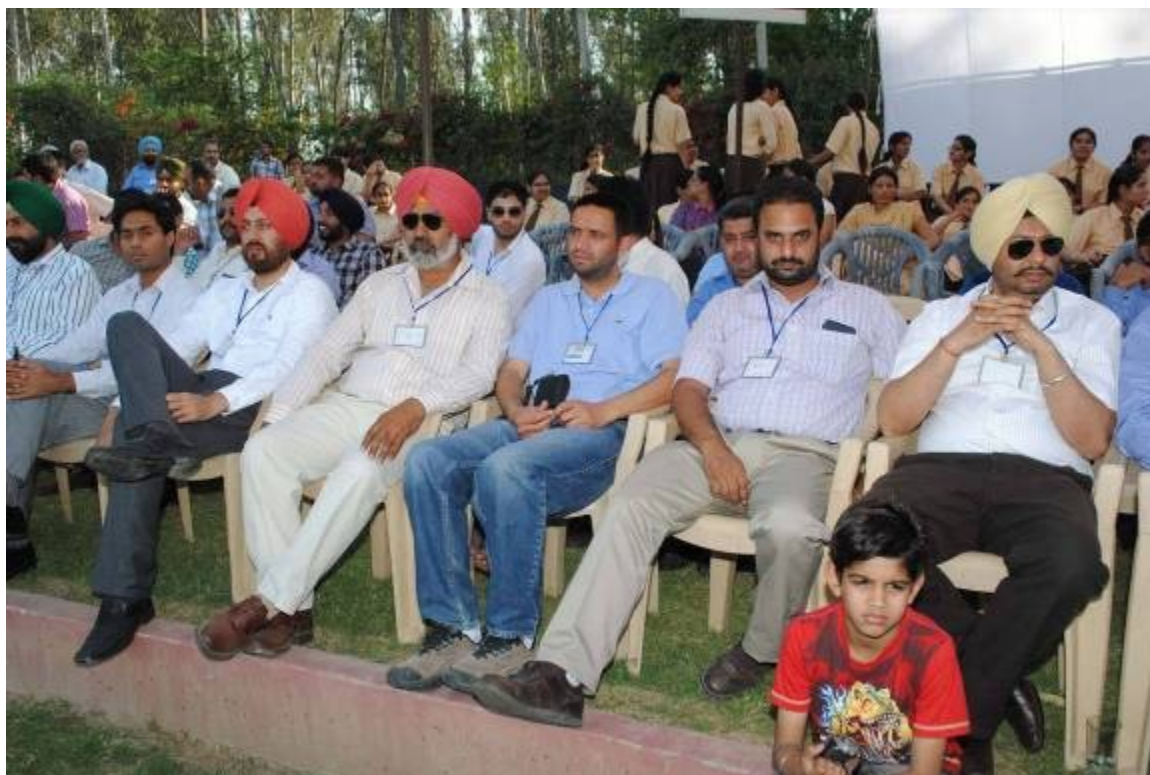
Non-playing Old Nabhaites watching the match