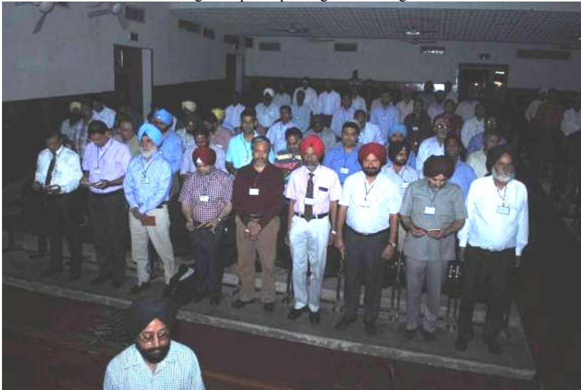
The School Song to commence the meeting.