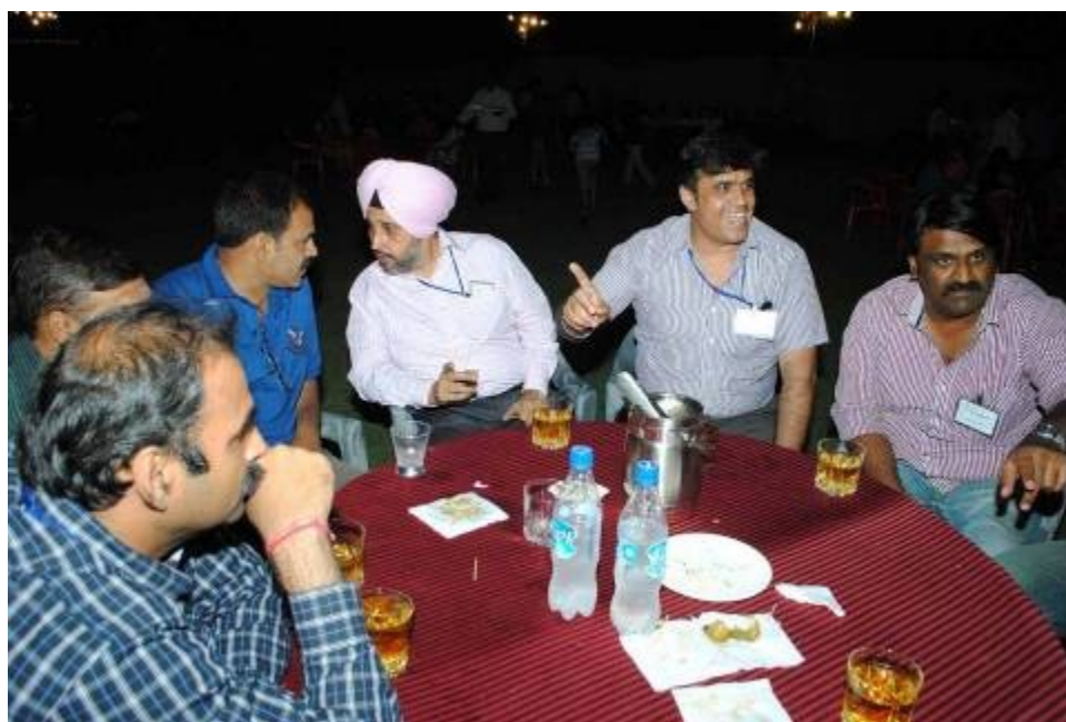
Glass half empty or half full?