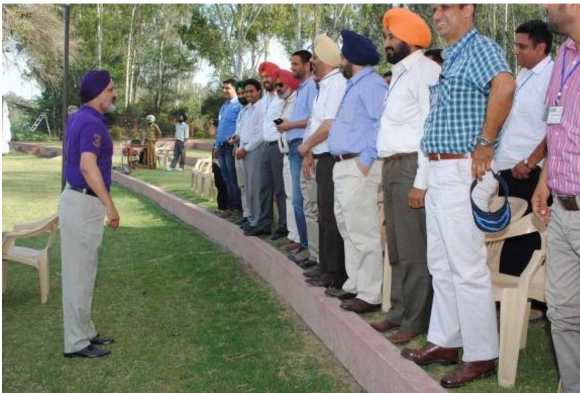
Headmaster with Old Nabhaites...courtesy to the Headmaster.