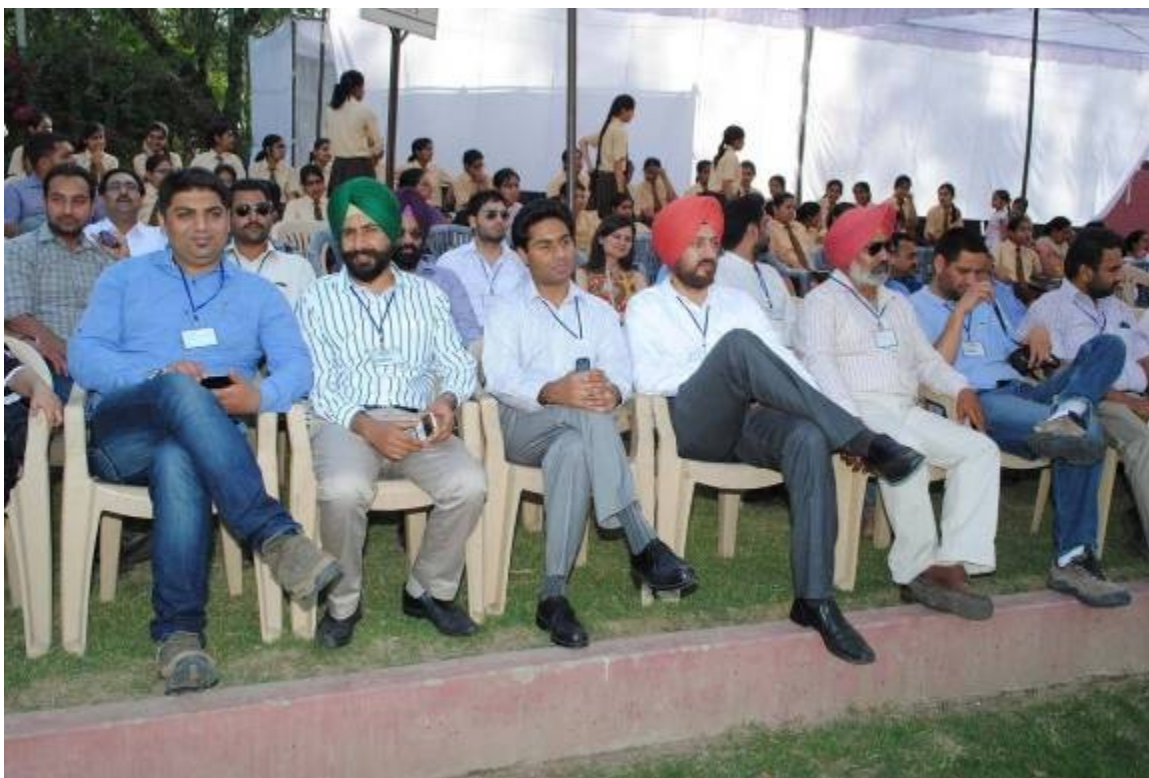
A section of the audience