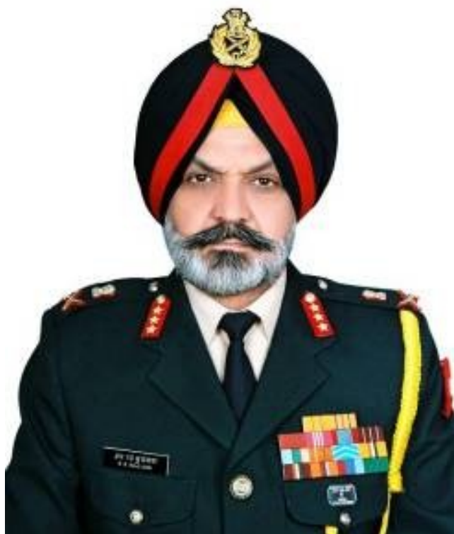
In full gear A flashback in time to PPS days