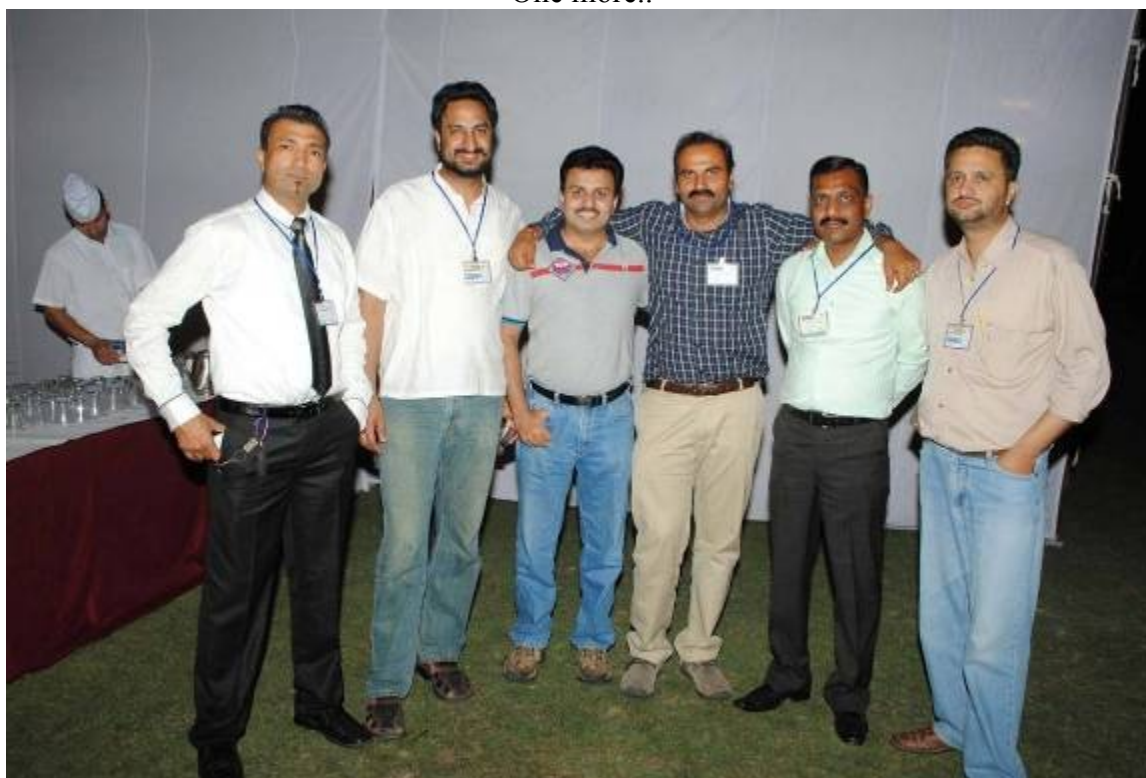
...and another !