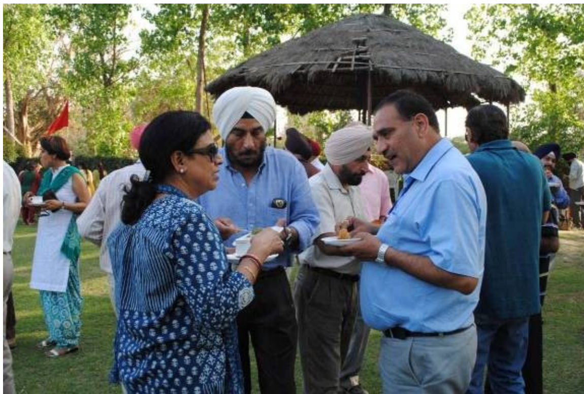
Tete- a- tete at tea time.