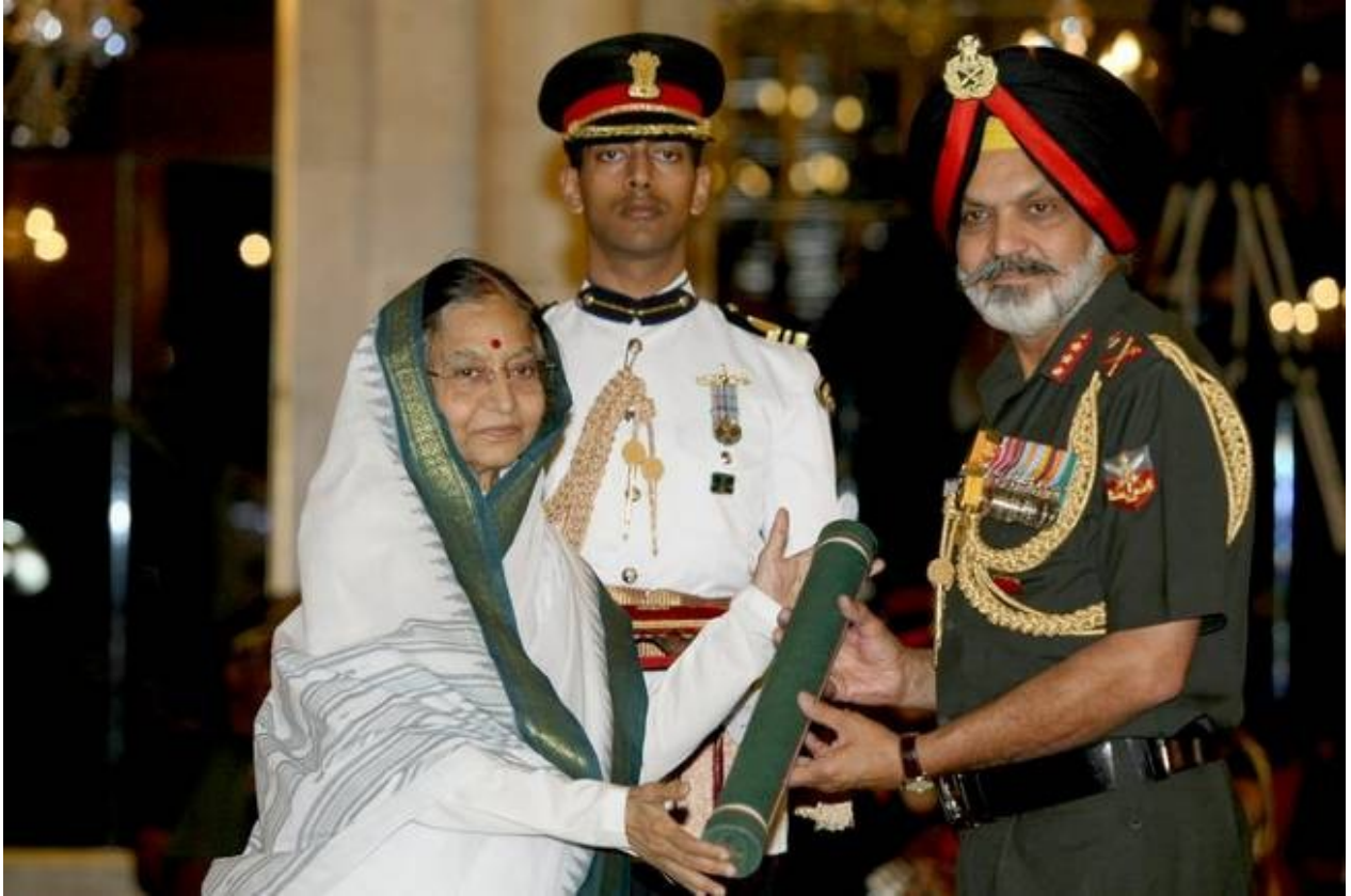
Honoured With Param Vishst Seva Medal.jpg